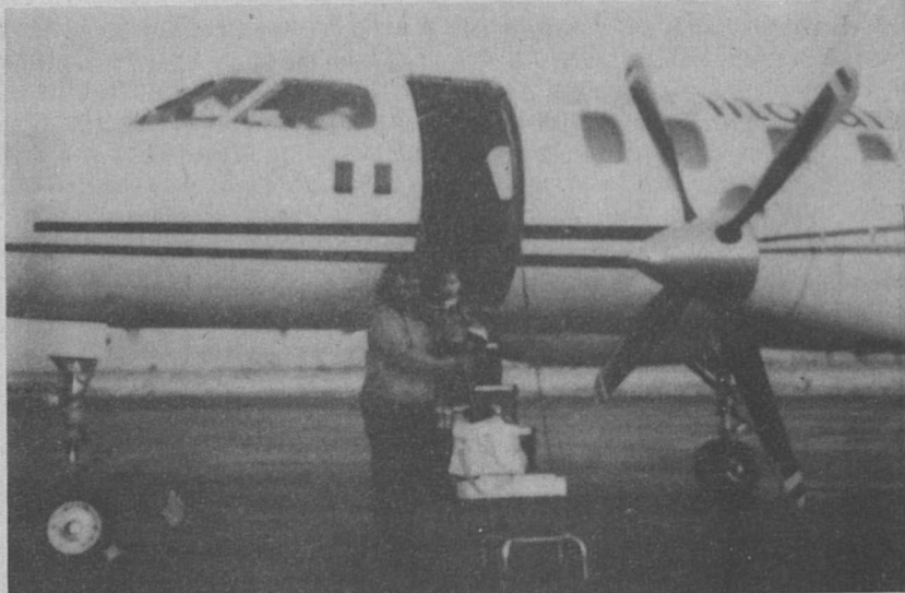
First plane trip

Please contact me at the Eagle Lake Medical Clinic, 234-2066, regarding any questions or suggestions on topics.