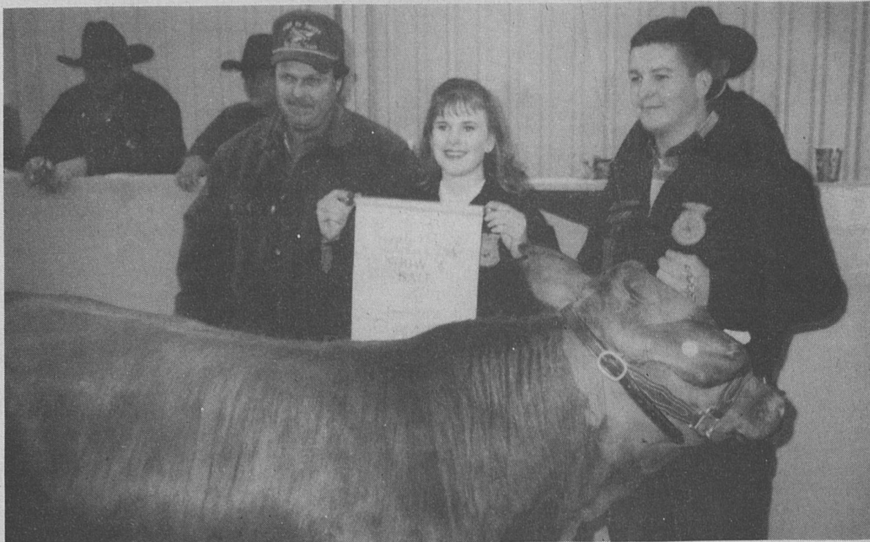
Reserve champion heifer